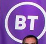
Young people take part in the Safer Internet Day flagship event in London